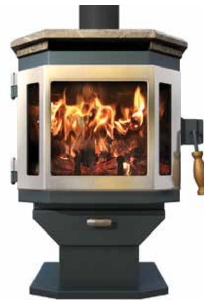
STAINLESS STEEL DOOR