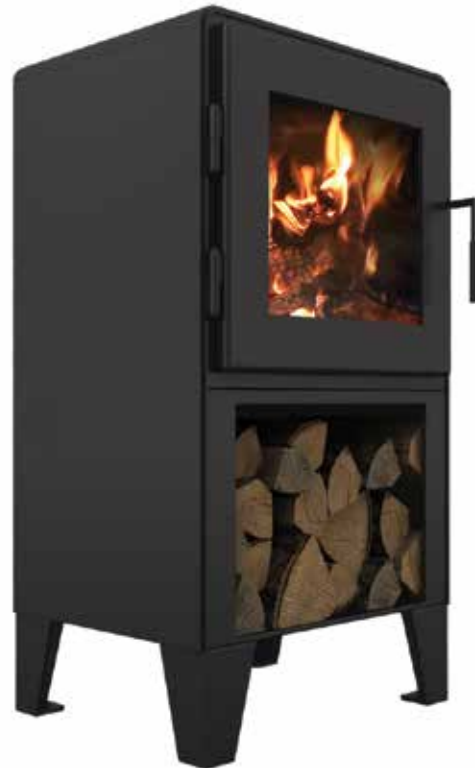
6" LEG KIT