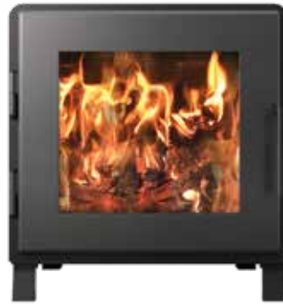
STAINLESS STEEL & CHARCOAL DOOR UPGRADE