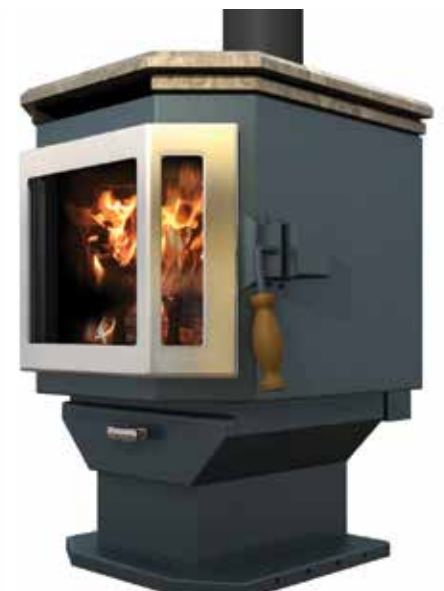
CUSTOM COLORS AVAILABLE